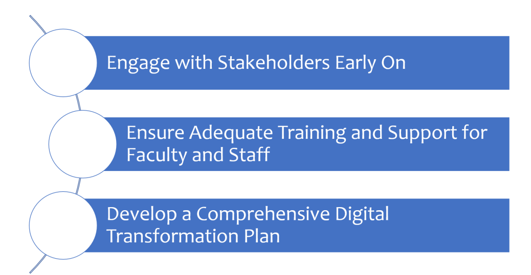
Figure 1. Best Practices for Implementing DT.